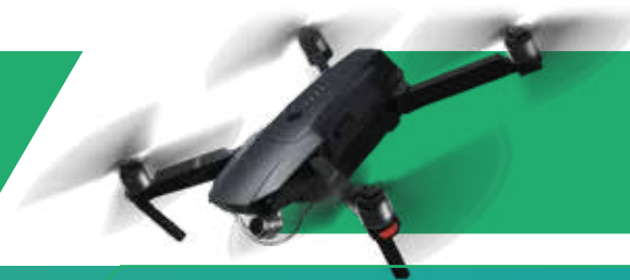
Urban Air Mobility (UAM) Solutions