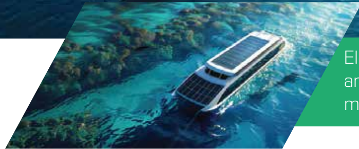
Electric, Hydrogen and Solar-powered maritime vehicles

The Evolve Future Mobility Show is leading the way in sustainable transportation, with a key emphasis on electric maritime vehicles. As the world embraces greener solutions, the event showcases cutting-edge innovations that are transforming the maritime industry, enhancing efficiency, and setting new benchmarks for eco-friendly waterborne travel.