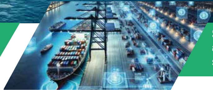
Smart ports & automated docking solutions