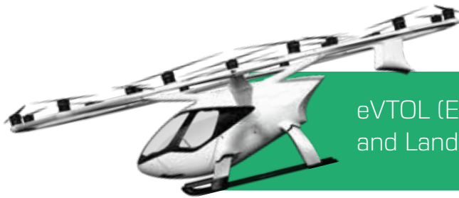
eVTOL (Electric Vertical Take-Off and Landing) aircraft

As the mobility landscape evolves, The Evolve Future Mobility Show will be a leading hub for innovation, investment, and industry collaboration, showcasing advancements in key sectors like electric aircraft, which are revolutionizing aviation by reducing carbon emissions and enhancing efficiency.